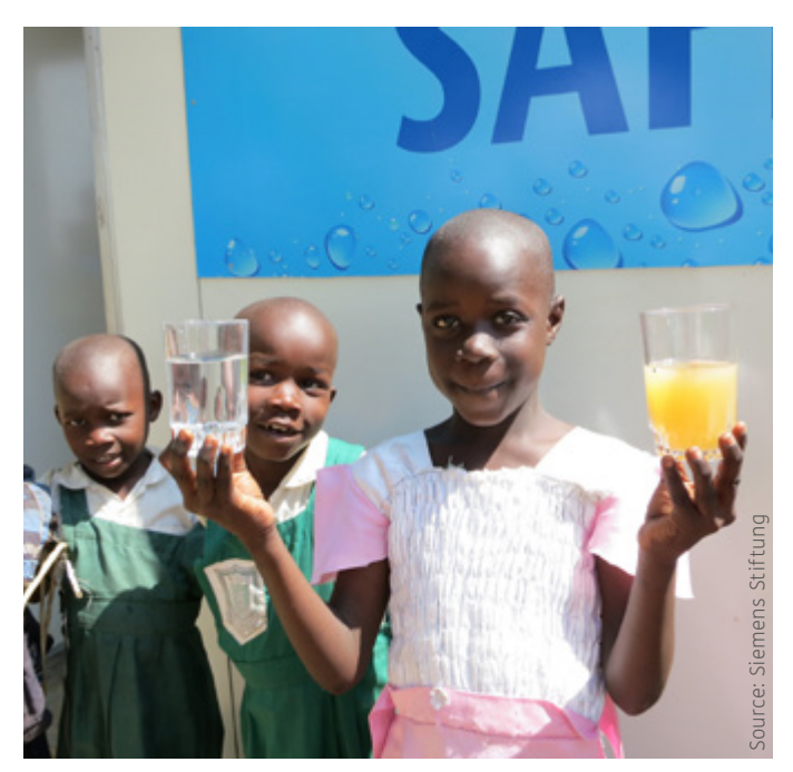
Figure 4 : School children at Kudho Safe Water Enterprise learning about the benefits of safe drinking water.

Successful operations of a kiosk ultimately depends on its management team, too. That's why the Kenyan/German SWE team have developed a curriculum that every local kiosk committee and kiosk manager completes. "The kiosk managers and committee learn, for example, how simple bookkeeping is prepared, what financial planning must look like and how prices need to be set so that operating costs can be covered. What is sales and marketing and what relevance does it have to running the kiosk? What does customer relationship mean? What are customers' interests and how do you deal with them – even though some of them can be dif-