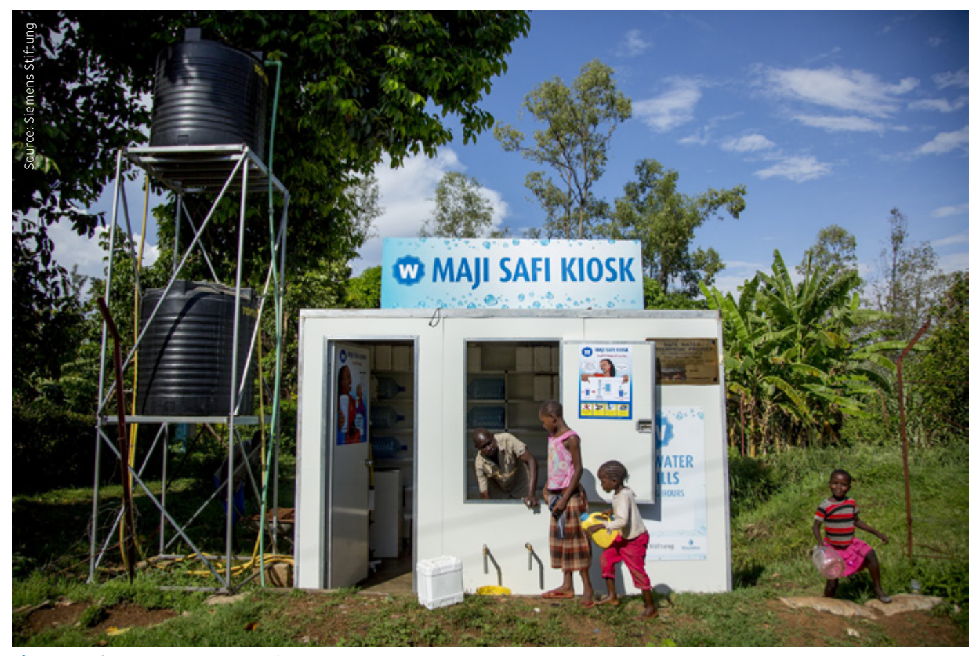
Figure 2: Safe Water Enterprise in Soko Kogweno, Kisumu, Kenya.

market and there's the traditional aid model – but not so many approaches aim to just cover costs. We were all aware that our pilot models were just the start of a learning process and the investments needed until the entrepreneurial model could stand on its own two feet would be considerable. Yet it's our conviction that only a self-supporting solution can enable our investment to have a long-term impact."