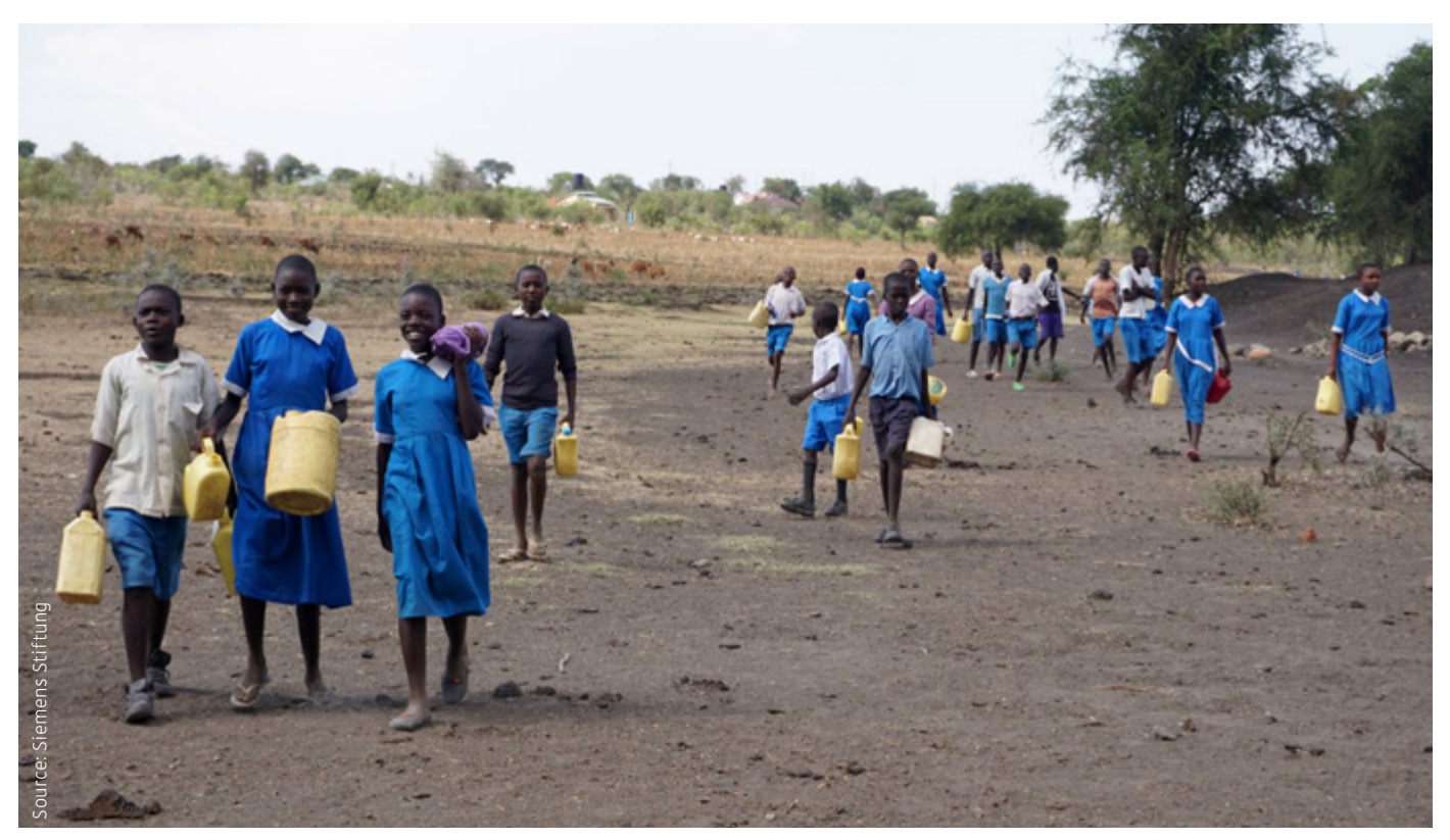
Figure 1: School children fetching water from a dam in Homa Bay, Kenya.