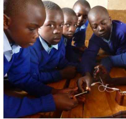
Educate teachers. Encourage students. Develop the future. Experimento, Siemens Stiftung's international educational program

Using Experimento has an impact on various levels: Teachers offer highquality teaching in scientific and technical subjects using modern educational methods. Students actively participate in lessons in a motivated manner and responsibly apply what they learn to their own environment. The knowledge and skills they acquire enable them to successfully complete training and continuing education. That means excellent prerequisites for individual opportunities in life and for Kenya as a business location.